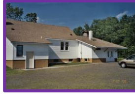
St. John's, Saginaw