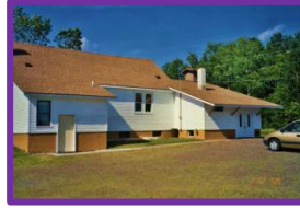
St. John's, Saginaw