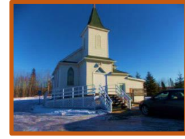
St. Peter's, Canyon