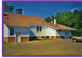
St. John's, Saginaw