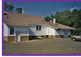
St. John's, Saginaw