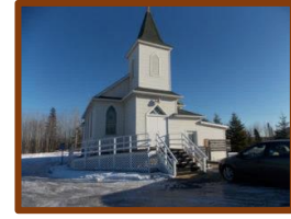
St. Peter's, Canyon