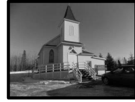
St. Peter's, Canyon