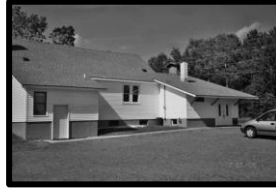
St. John's, Saginaw