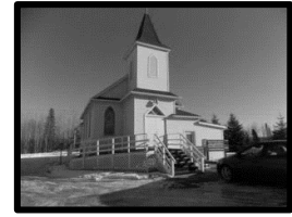
St. Peter's, Canyon