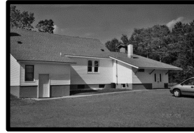
St. John's, Saginaw