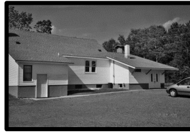
St. John's, Saginaw