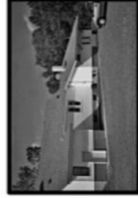
St. John's, Saginaw