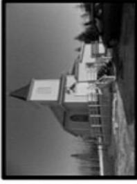
St. Peter's, Canyon