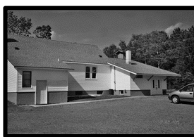
St. John's, Saginaw