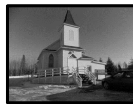
St. Peter's, Canyon