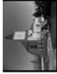
St. Peter's, Canyon