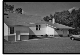
St. John's, Saginaw