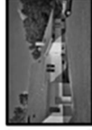
St. John's, Saginaw