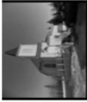
St. Peter's, Canyon