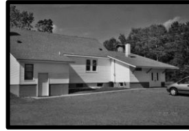
St. John's, Saginaw