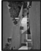
St. John's, Saginaw